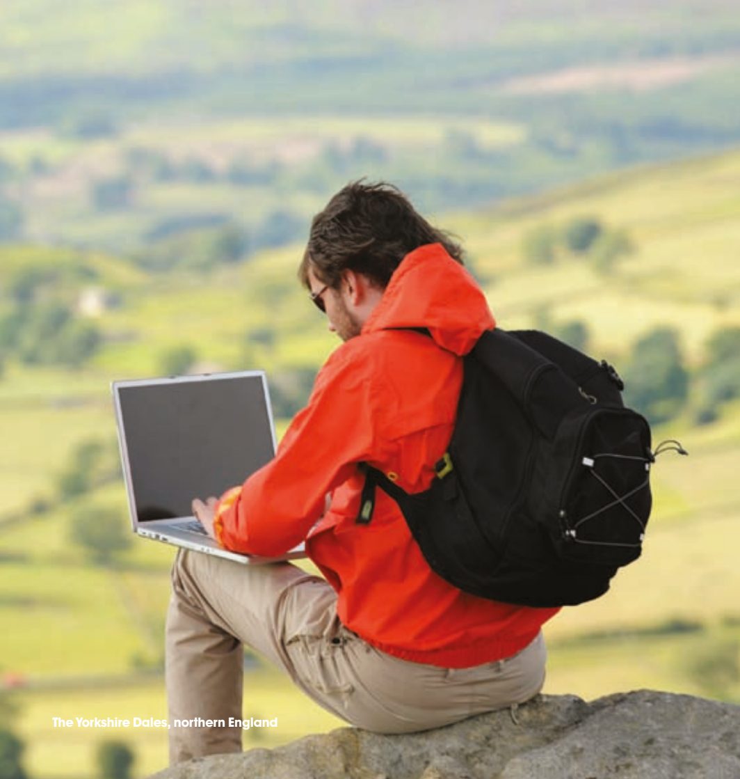
The Yorkshire Dales, northern England