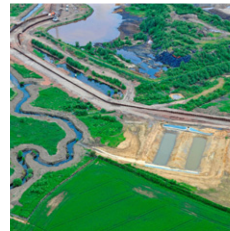
Above: River diversion around contaminated lagoons on former coking works.

The London 2012 Olympic Park has embraced sustainability and has set itself ambitious targets of lowering carbon emissions by at least 50 per cent, reducing potable water use by 40 per cent, importing over 50 per cent by weight of construction materials by water and rail, and obtaining 20 per cent of construction materials from recycled and secondary sources. The Park is making good progress towards achieving these sustainability goals. Its state-of-the-art Energy Centre, for example, includes biomass (woodchip) boilers and Combined Cooling Heat and Power plants (gas), that are 30 per cent more efficient than traditional generation methods.