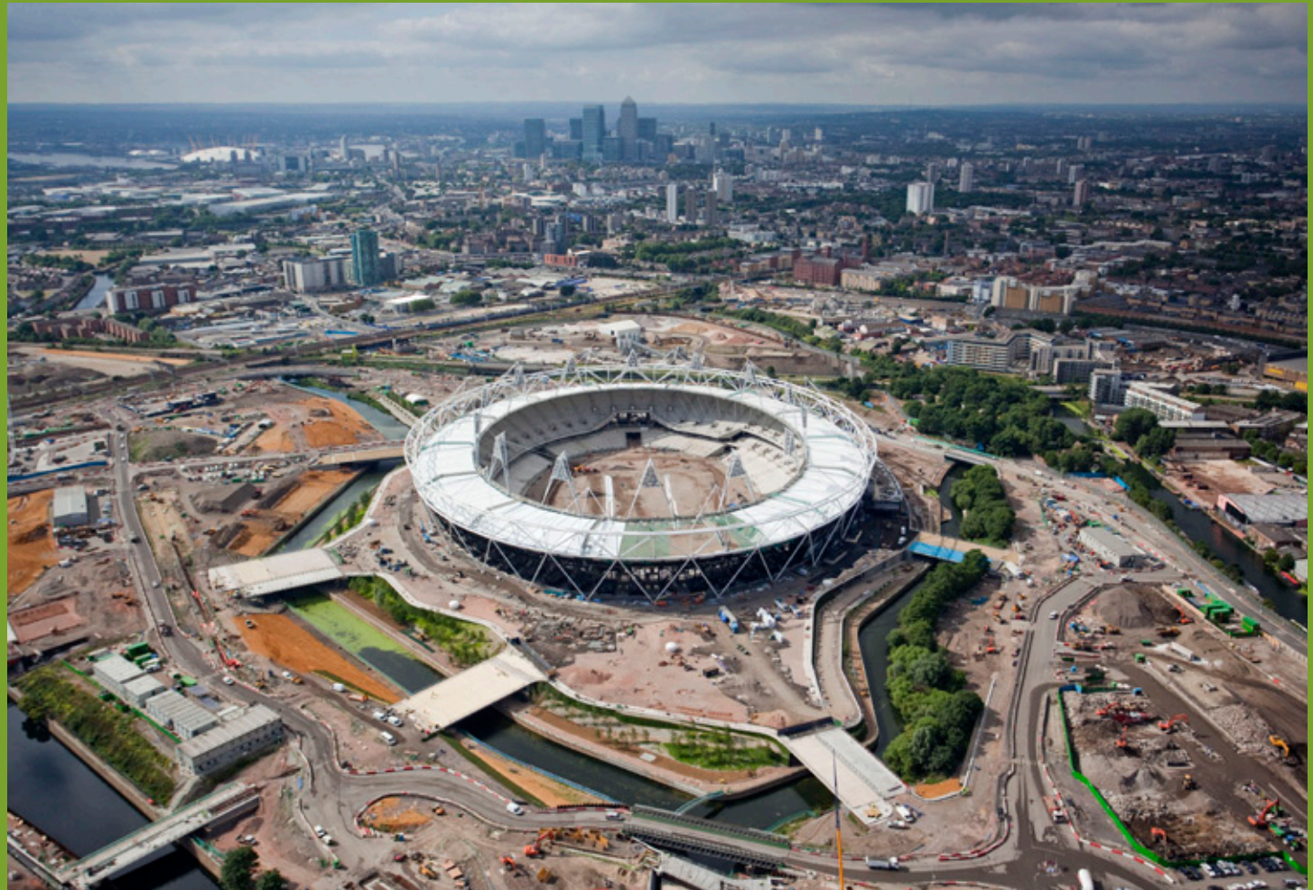
Above: Construction of London 2012 Olympic Stadium on former contaminated land site.