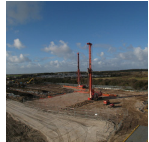
Above: Chemical oxidation by in-situ soil mixing on former chemical works.

Commercially driven and entrepreneurially minded, the UK contaminated land and remediation industry is ready to respond quickly to business opportunities overseas. Offering world-leading consultancy, as well as cutting-edge products and technology, its adaptable and innovative solutions can help to address any CLR challenge, wherever it may be in the world.