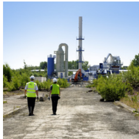
Above: Thermal desorption plant for treatment of heavily contaminated soil from coking works.

When land has been identified as contaminated and posing a risk to humans and/or the environment then some form of remedial action must be undertaken. UK companies have remediated over 33,000 hectares of contaminated land in the UK alone, utilising a wide range of green technologies across physical, biological, chemical and thermal treatments for the remediation of both soil and groundwater.