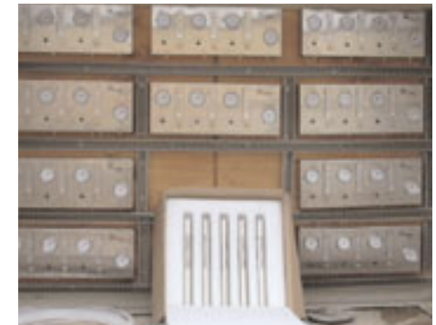
Above: Control panel for in situ bioremediation system of direct oxygen infusion cells.

The site works were completed in conjunction with re-profiling of the site involving the excavation, movement and validation of 280,000m 3 of soils and the installation of 1.2km of sheet pile wall around the perimeter of the site, to create a new waterfront path around the development site.