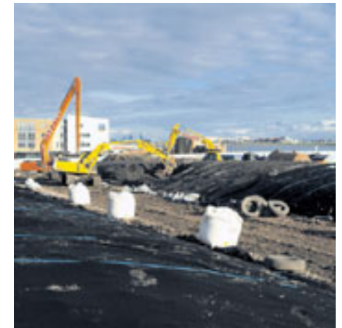
Above: Ex-situ bioremediation of contaminated soils from former fuel depot.

All the necessary reports and supplementary studies were successfully completed, including geotechnical and environmental intrusive investigations. The reports were then submitted to the appropriate local authorities in pursuit of the relevant environmental permits.