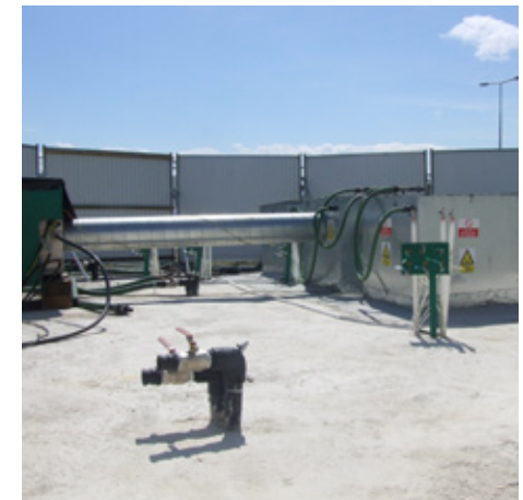
Above: Thermal enhanced vacuum extraction by radio frequency heating.

The whole process, from investigation of the site to the selection of the most appropriate remedial options, is increasingly tied to achieving a more sustainable land management solution. Expertise in risk assessment against suitable-for-use criteria ensures the UK is comfortable in using Monitored Natural Attenuation – an approach that requires in-depth knowledge of fate and transport mechanisms and a true and pragmatic assessment of risk.